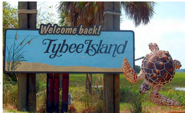
Saturday will involve seminars and workshops on methods to improve our educational programs of safe boating practices for the general public as well as tours of the Tybee Lighthouse and Fort Screven for family members. Saturday evening will feature the District 26 Annual Change of Watch with catered dinner and entertainment at the Tybee Light Shrine Club.

We will kick off the weekend with a tour of the Savannah Ports, followed by an Oyster Roast and low -country boil on the Tybee pavilion Friday evening.