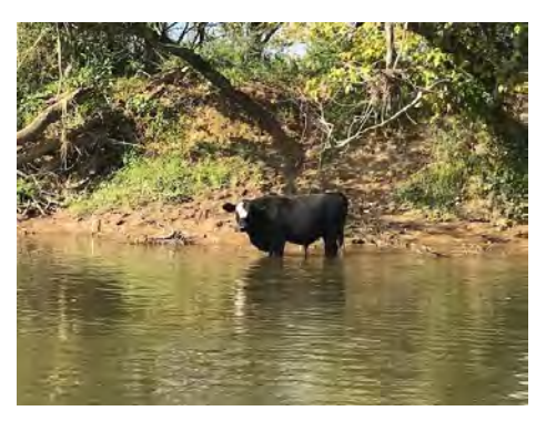
Along the way, we had a little company.